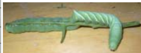
Hornworms, found in the greenhouse this week. The first sign of them is usually their excrement ("frass"), scattered on leaves or beneath the plant, or else large gouges in the tomatoes or finding entire branches defoliated! They blend right in with the plant and can be hard to locate. We haven't had too much trouble with them so far this year. The best remedy is handpicking. I'm afraid I generally squish them, since even the chickens are repulsed by them!

Last week was unusual in that we had 3 shareholder mix-ups. Someone took the wrong basket, leaving the rightful people wondering where their share was; 2 members were total no-shows, leaving us wondering what to do with their vegetables. Please , let us know if you'd like us to put your share in the cooler overnight, or if we should find a home for it if you suddenly find yourself unable to get here. If we haven't heard from you in 24 hours, we will send the veggies elsewhere. Generally it all works out, and hopefully it was just an odd week!